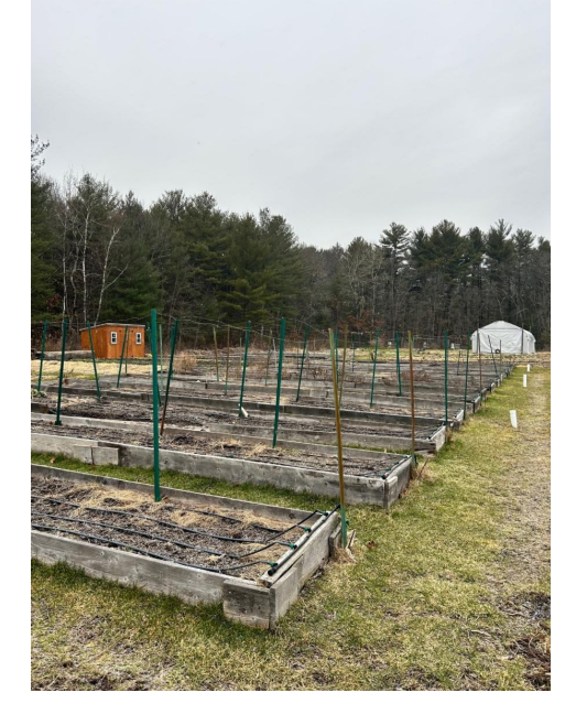
Sleeping farm on a snowy January morning