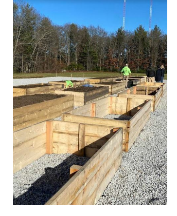
Bed construction underway!