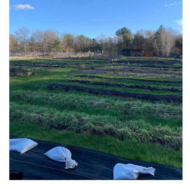
December view of the fields at Pine Street