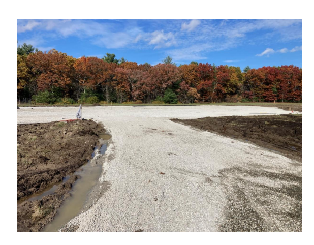
The bed area being filled and tamped with gravel, prior to bed construction